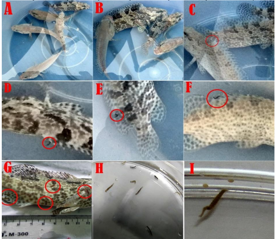
Figure 2. Growth of leech (A: day 1; B: day 2; C: day 4; D: day 6; E: day 8; F: day 9; G: harvest leech day 9; H: leech, I: leech produced eggs)

On day 1 and day 2, leech larvae still not visible because the size is still small. On day 4 (C) the larvae has grown and can be observed. On day 6 (D) leech has been seen infecting on the fins, body surface and tail. On the day 9 (F) leech has reached the size of 10 mm until 15 mm, then collected (G). The collected leeches were placed